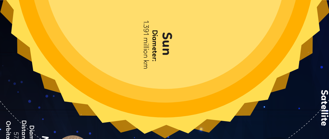
Sun Diameter: 1,391 million km

Diameter: 4,879 km Distance from the Sun: 57.91 million km Orbital Period: 88 days